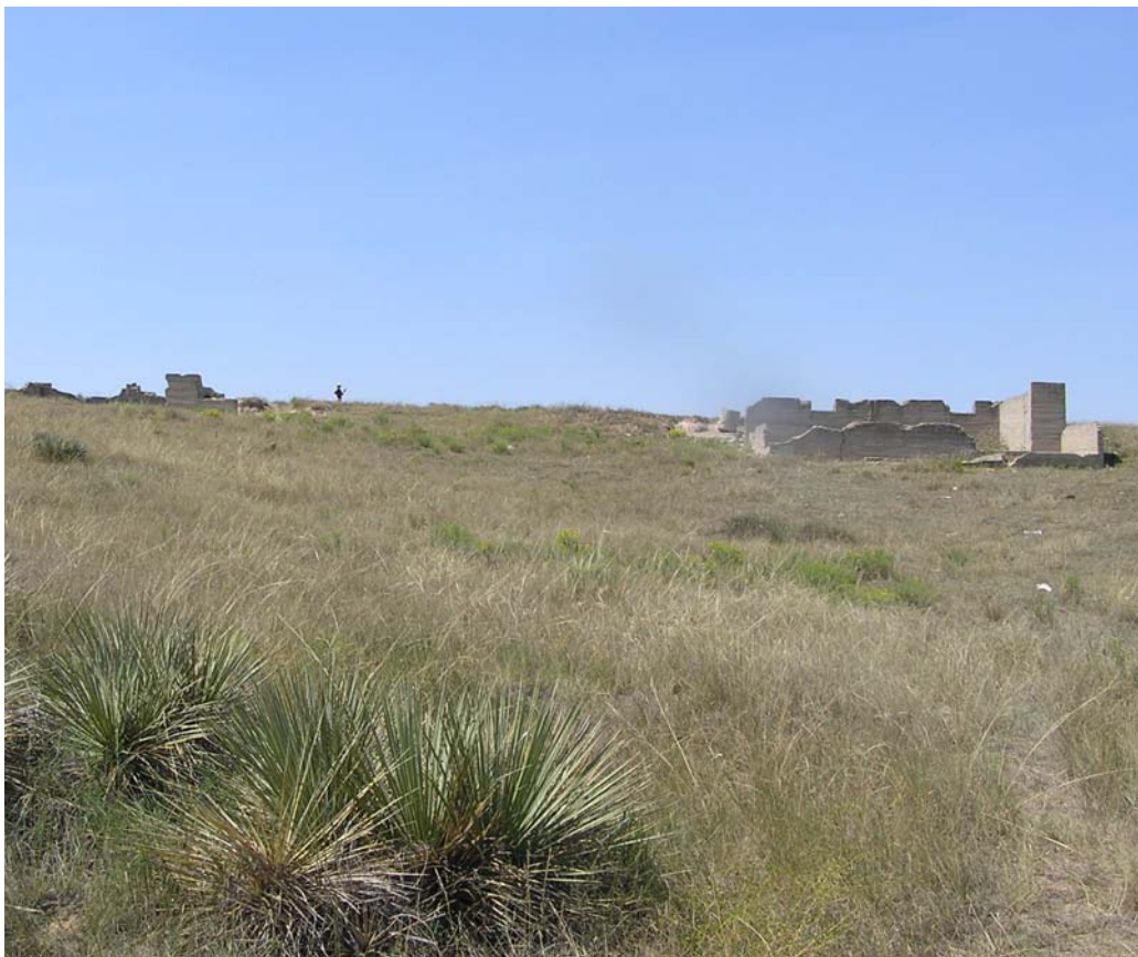
The Johnson Homestead.