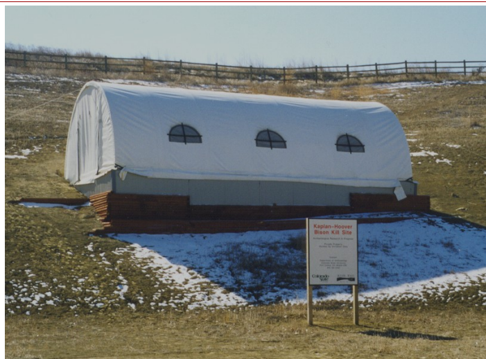
Kaplan-Hoover site in April 2000

We will meet at 10:30 am in Fort Collins and carpool to the site. After visiting the trail sign and viewing the site area, some may stay together for lunch in Windsor. For details and to sign up, contact Field Trip Coordinator Jessica Anderson at (805) 276- 0007 or jessica.anderson@colostate.edu .