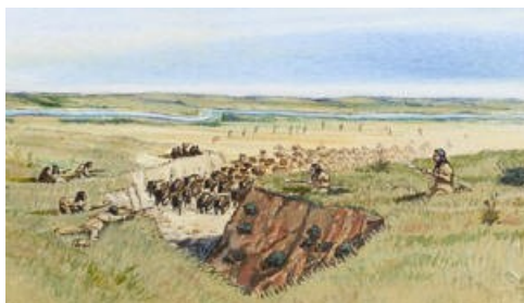
Exhibit open- ing and reception: 5 - 7 pm in the NPS Headquarters Building on Museum grounds. Special showing of the film: American Buffalo: Spirit of a Nation followed by opening of Awakening Stories of Ancient Bison Hunting exhibit and reception. Free. Exhibit runs through July 17. http://www.estesnet.com/Museum/events.html .

Friday, Feb 4, Film: 4:30- 5:30 pm, Mu- seum meeting room, 200 Fourth St., Estes Park.