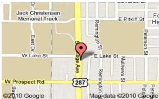
Mesa Verde

This program is free and open to the public . Please join us!