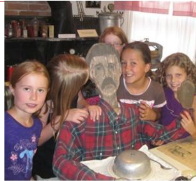
Fourth grade students at the Ouray County Historical Society Museum.