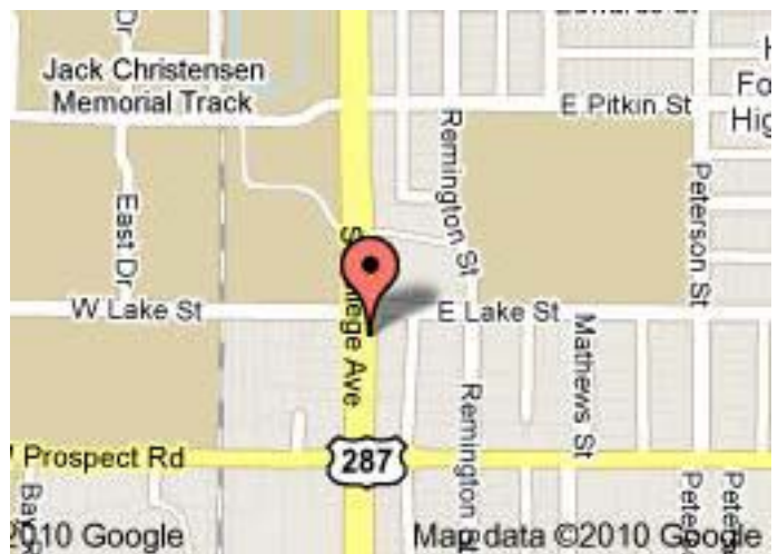
The WILD BOAR COFFEE SHOP

DUES ARE DUE: Please give your check and application (last page of the newsletter) to Ron at the next meeting or mail it to: NCC/CAS, PO BOX 271512 FORT COLLINS, CO 80527-073